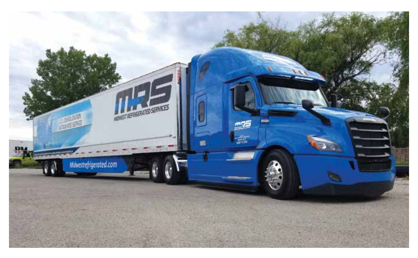
From the Midwest Refrigerated Services fleet.

see this as another technological investment in best practices."