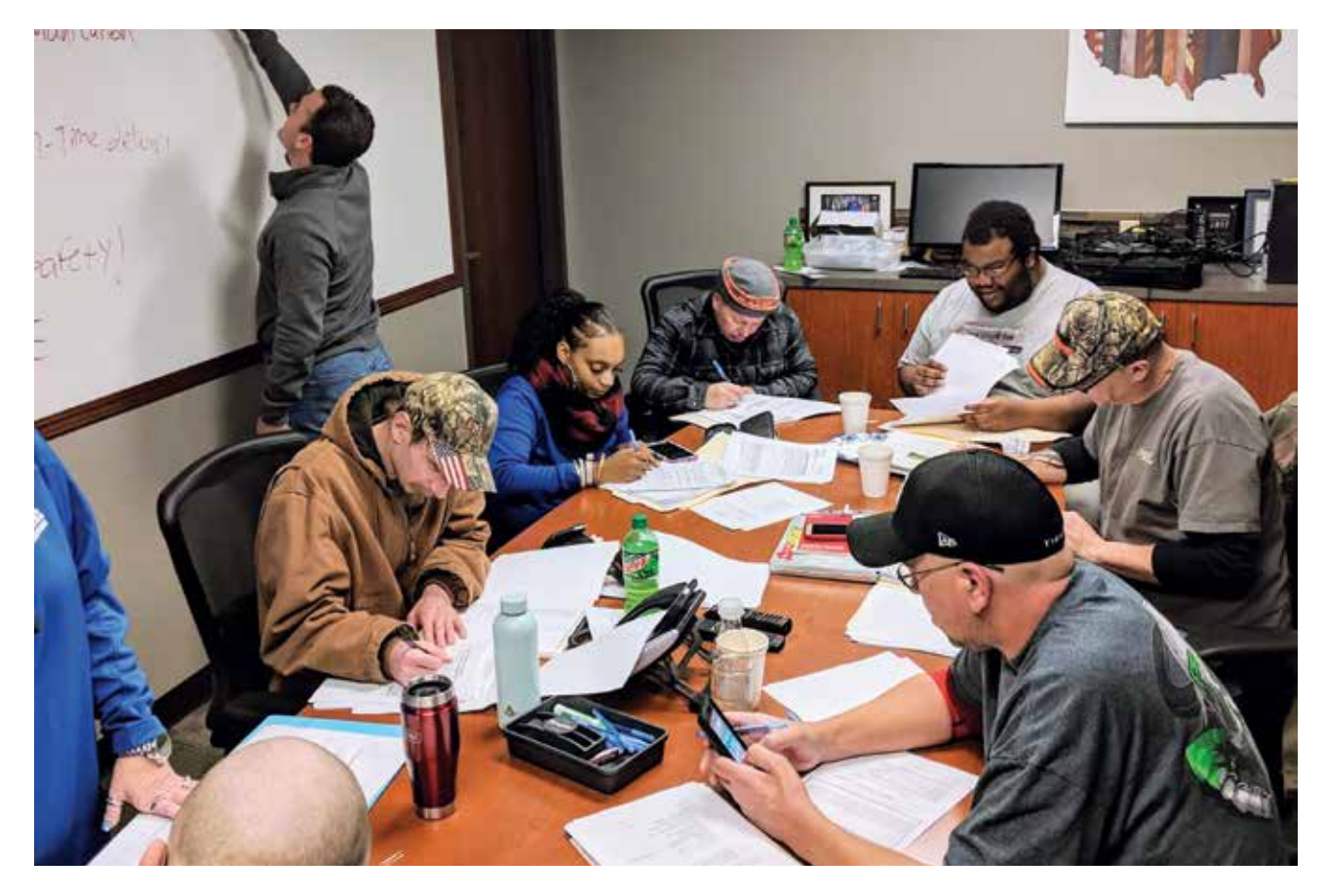
The first training class conducted by Great Plains Transport where the Certified Cold Carrier Standard Operating Procedure is added to the driver training program.

we had adapted it to include Certified Cold Carrier requirements.