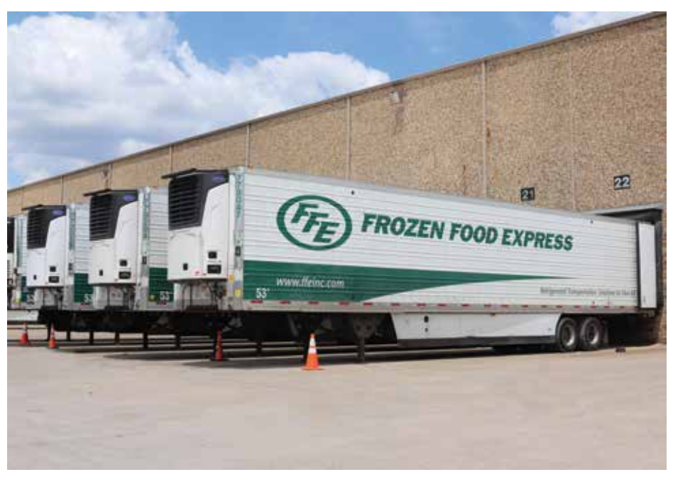
FFE refrigerated trailers at the loading dock.