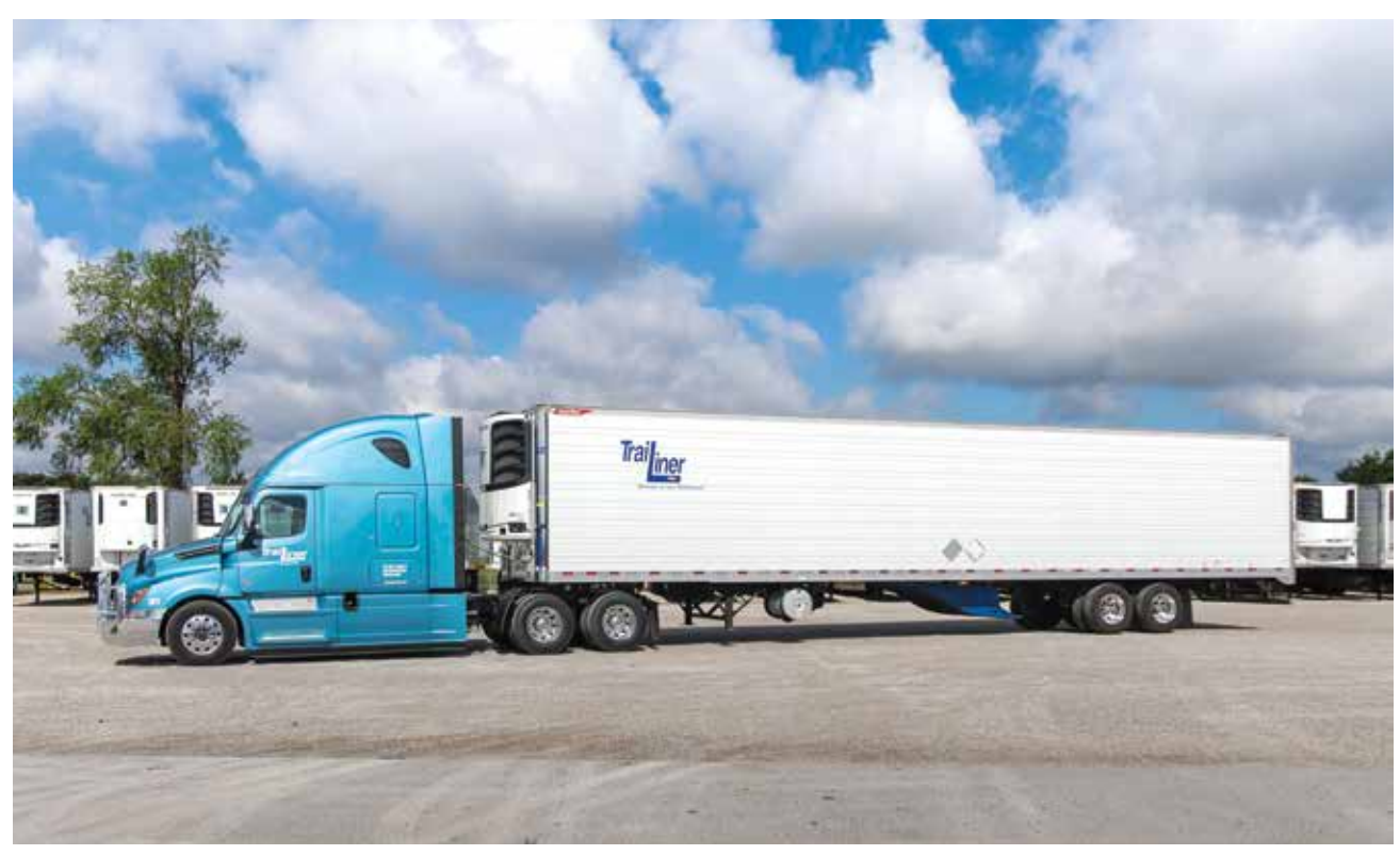
From the Trailiner Fleet.

"We are absolutely a better company for going through the Certified Cold Carrier process," Koeble says. "While we were following the GCCA Best Practices Guide, we found that not all of those practices were adequately documented in policy or procedure. Going